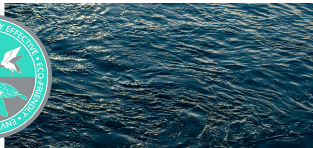
With Quantum XR Organic Descaler