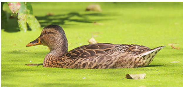
With Traditional In-Organic Descalers